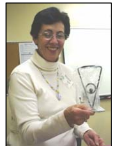
Some members enjoying their Christmas gifts

With this year bringing many new members into our fold we are delighted to make their friendships, share moments, listen to tales, and see the excitement in their eyes during a field trip or a program. May they continue to be fascinated by the natural bounty of gifts they can see, discover, and collect from the fieldtrips, tailgates, trading and or buying. Take time to get to know everyone as it may well be, by passing on your experiences to them, you help them grow in their future knowledge and skills.