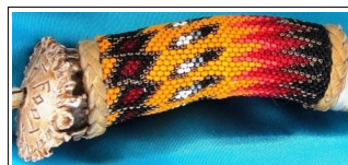
Beaded antler knife handle

and friends. It's a real treat to meet fellow club members and other club members that you may not see but once a year. It is amazing how many you will meet no matter which of the shows you go to. Oh, did I mention that if you don't... well you now know by now don't you? Hope to see you there next year!!