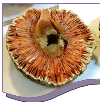
Walt Wright Seed Cone

Petrified Wood is a very well-known fossil plant. In the petrification process, the solid trunk of a tree is replaced by a mineral, usually silica. The cellular structure of the tree is then an exact replica of the original tree now in rock. The colors associated with petrified wood come from the trace elements associated with the mineral that replaced it.