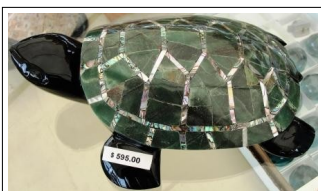
Obsidian Jade and Abalone mosaic tortoise