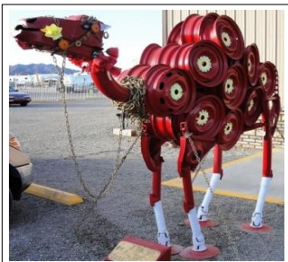
Hi Jolly camel made of wrecking yard auto parts