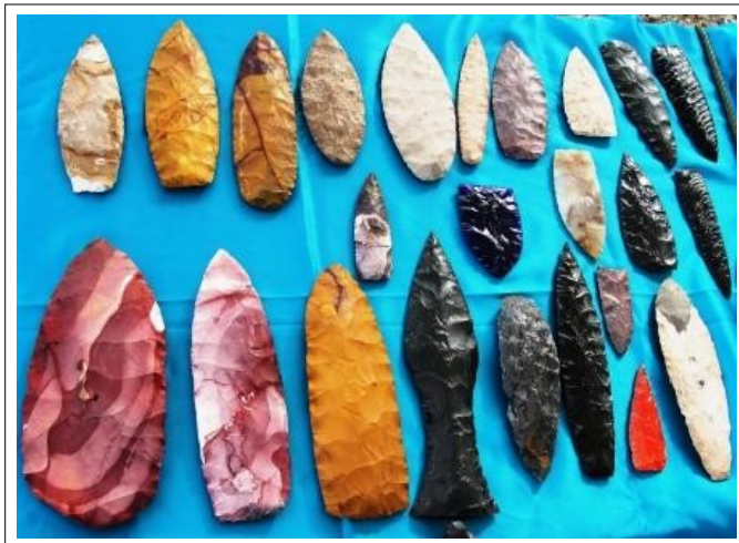
Hand knapped custom arrowheads, spear points, knives, etc.

If you haven't been then you really need to plan on going next year. Mark your calendar for Jan - Feb 2013, you can go any days therein. It is a mere four hour drive but you can see many different things on the way there, even the Wind Farm in Palm Springs if you have never seen it - is quite a sight! I would like to encourage you to think about planning and going next year, it's fun, educational, entertaining, enlightening and entuses you with renewed vigor for the love of the arts. Why would I recommend this trip you ask, I'm glad you asked because here is why;