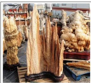
Stalactites as objects of art for corporate or personal galleries