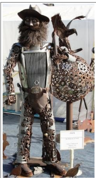
Recycled metal prospector